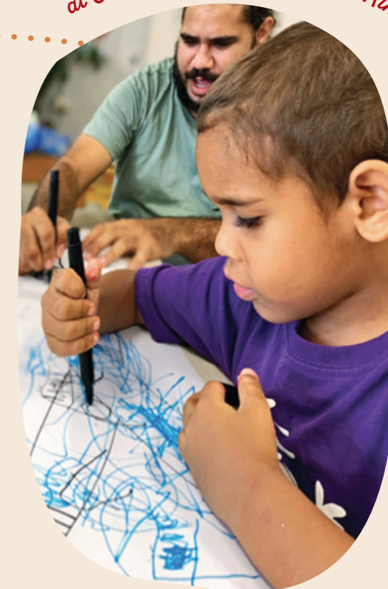
Activities in traditional language at C&K Edmonton Community Kindergarten

Local families choose to send their children and grandchildren to the centre because they feel safe in the culturally respectful ways the programs are delivered. Families are engaged to support their children, through a home reading program and events to discuss literacy activities, ideas, challenges, and their child's progress.