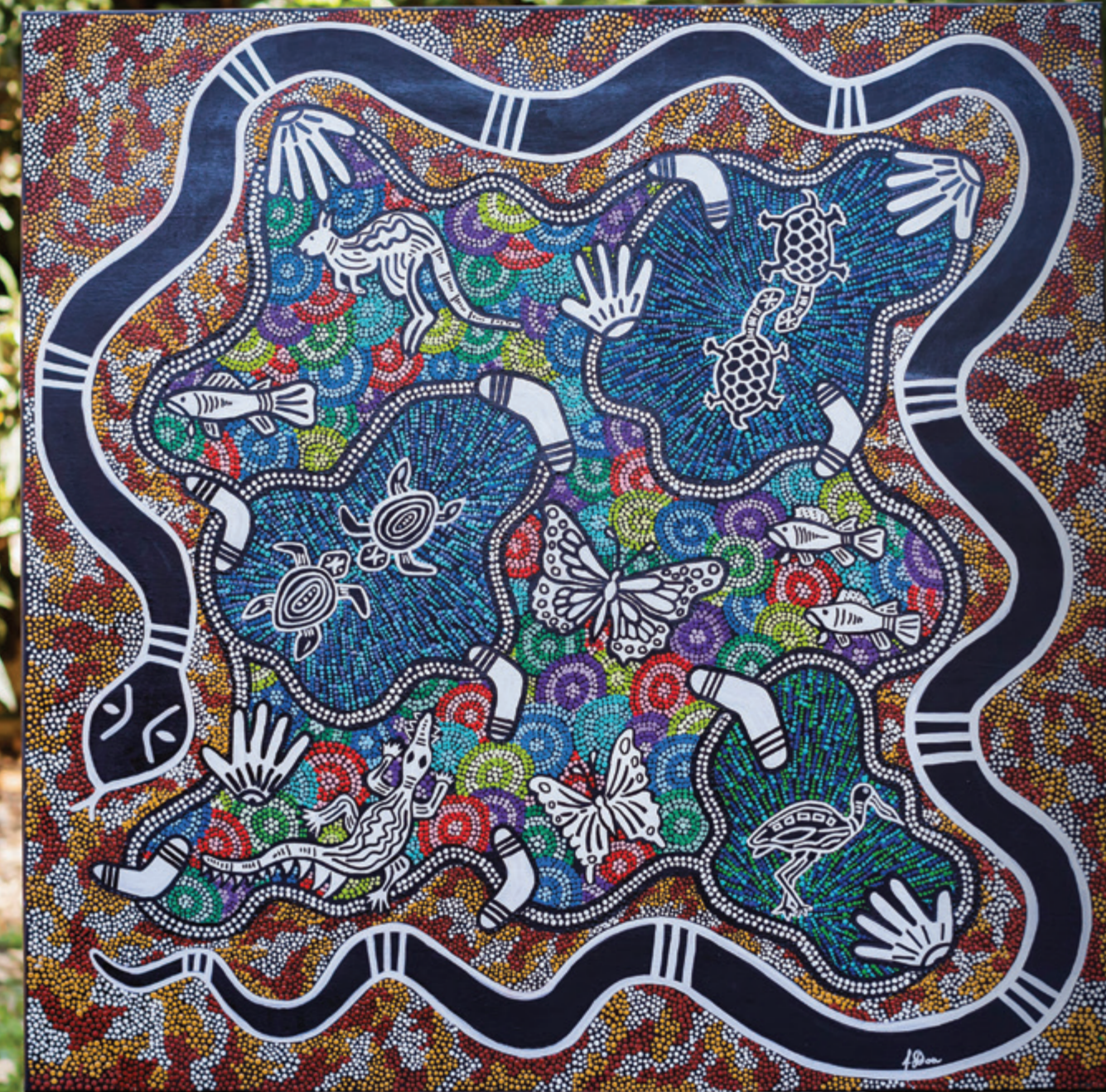
Djama, Bama: “Bringing up the next generation”