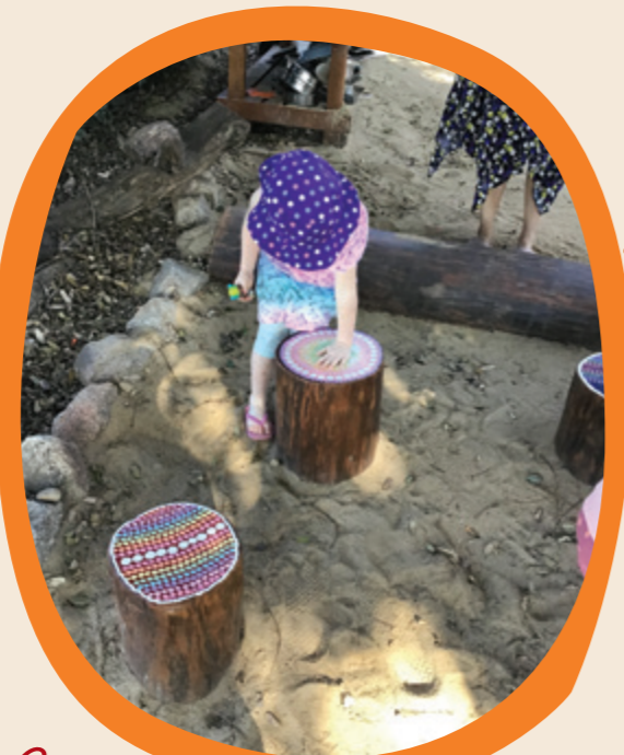
C&K Inala's yarning circle

Before launching their bush tucker garden, teachers and educators asked the children what reconciliation and yarning meant to them. They described reconciliation as “holding hands”, “being with our friends”, “being quiet and respectful” and “listening to someone”. The children were encouraged to represent their thinking through drawings, which were coupled with sticks they found, and presented as thank you gifts to their community.