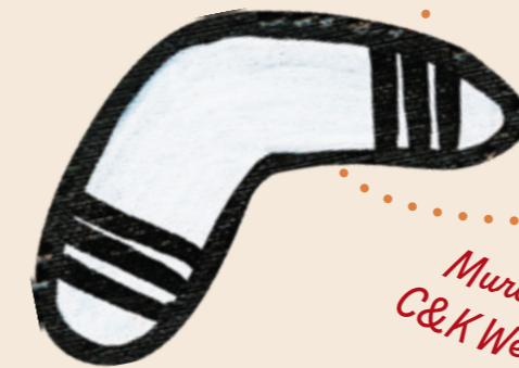
Mural of belonging at C&K West Moreton Community Kindergarten

The education team and children worked in partnership with C&K Koobara Aboriginal and Torres Strait Islander Kindergarten to create a native beehive and plant a garden to attract native Australian stingless bees. The project taught the teachers, educators, and children a deep respect for the Traditional Custodians of our land, as they learned to be more aware of their environment, how reliant species are on each other and the importance of respecting our land for a sustainable future.